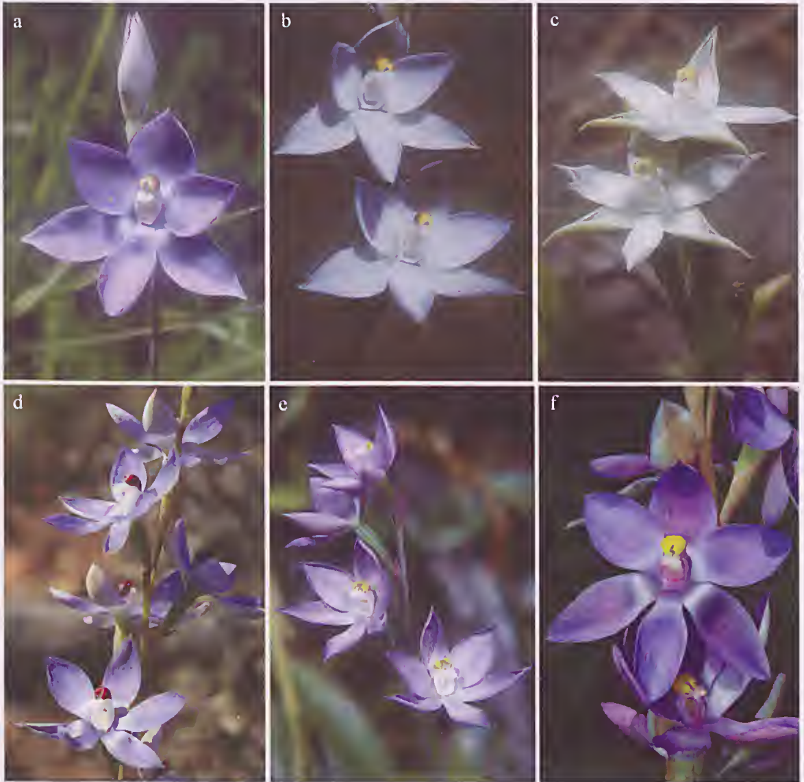
Figure 1. a. Thelymitra gregaria Derrinallum, Vic. (photograph by J.A. Jeanes); b. T. aggericola , Arthur River, Tas. (photograph by J.A. Jeanes); c. T. granitora , Walpole, WA (photograph by J.A. Jeanes); d. T. petrophila , Brookton, WA (photograph by J.A. Jeanes); e. T. fragrans , Gibraltar Range N.P., NSW (photograph by J.A. Jeanes); f. T. queenslandica , Herberton Range, Qld (photograph by B. Gray)

5–10 mm long, 1–3 mm wide. Flowers 2–10(–15), (15–)20–30(–40) mm across, usually pale blue to mauve, sometimes pink, opening freely in warm weather. Perianth segments (7–)10–15(–20) mm long, 3–8 mm wide, concave, often shortly apiculate; dorsal sepal ovate, obtuse to subacute; lateral sepals lanceolate to ovate, slightly asymmetric, acute to obtuse; petals ovate, obtuse to subacute; labellum narrow-ovate to lanceolate, acute, often smaller than other segments. Column erect from the end of ovary, (4–)5–7 mm long, 2–4 mm wide,